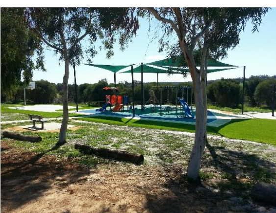
Sussex Bend Playground – Maryville Downs