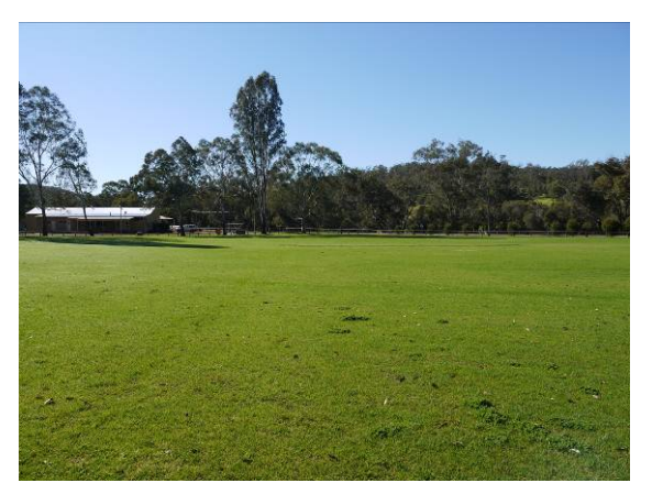
Lower Chittering oval and hall