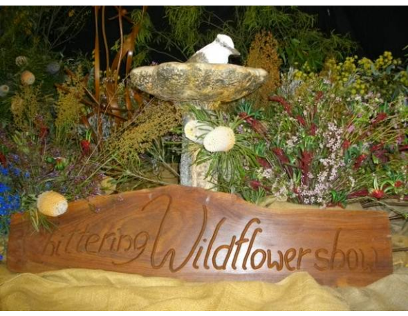
Chittering Wildflower Show, Bindoon