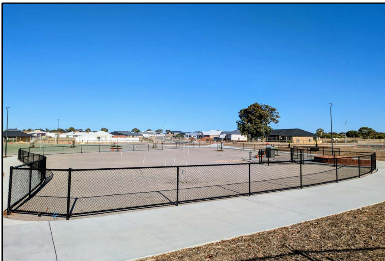
Photo 1: Wildflower Ridge dog exercise area under construction - March 2026 (EMDS)