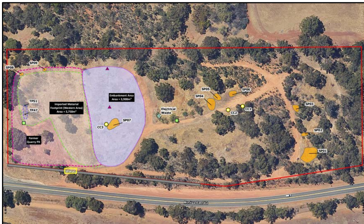
Extract from RAP – Contamination areas

Since receiving the finalised RAP in August 2023, the Shire has secured the site with a locked gate and appropriate signage to deter unauthorised public access, as recommended by the RAP. Shire officers have clarified with DWER that there is no further legislative obligation to undertake remediation of the site, now that it has been 'secured'. However, if the Shire (or future owners) wish to use the site for any purpose, it will need to be remediated in accordance with the RAP.