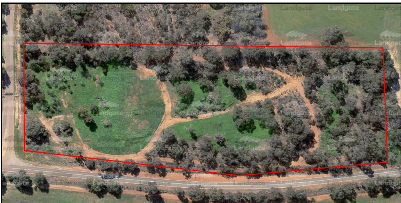
September 2025 – Landgate aerial imagery