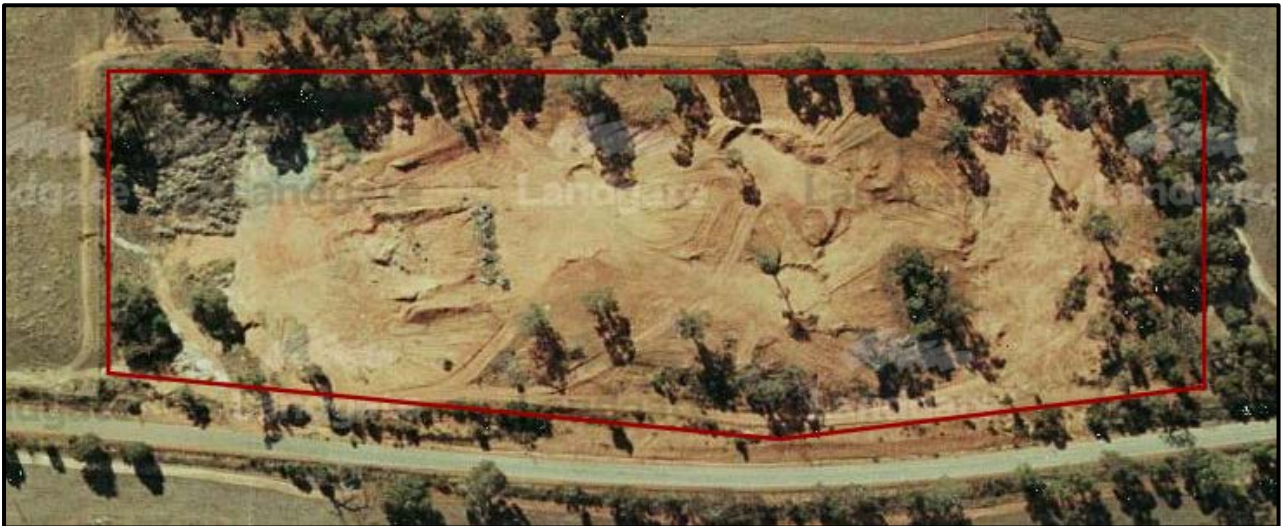
June 1985 - Landgate aerial imagery