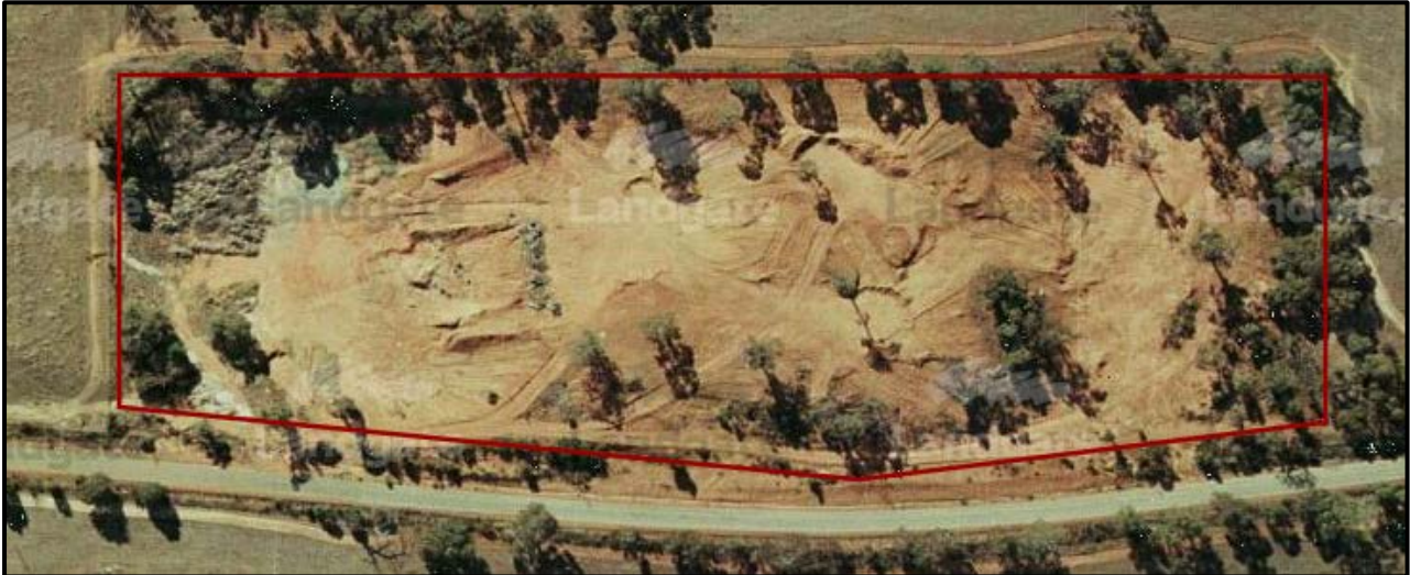
June 1985 - Landgate aerial imagery