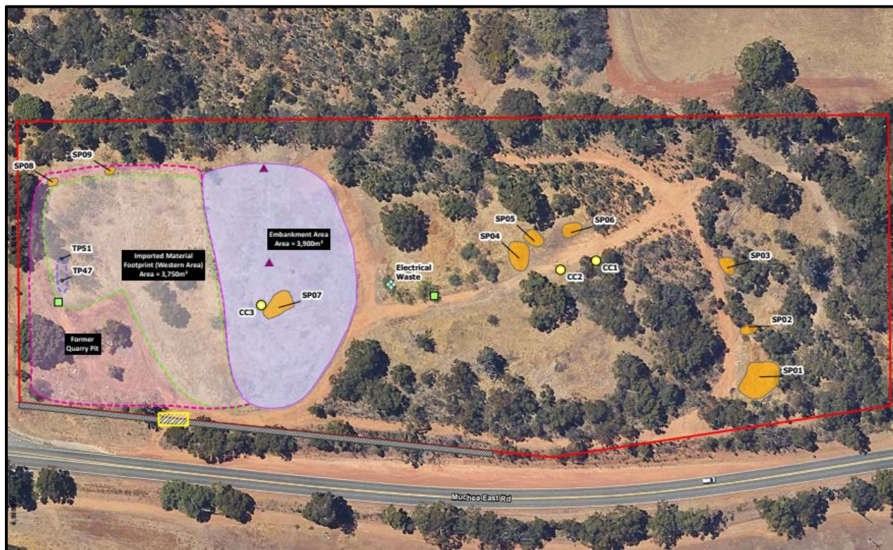
Extract from RAP – Contamination areas

Since receiving the finalised RAP in August 2023, the Shire has secured the site with a locked gate and appropriate signage to deter unauthorised public access, as recommended by the RAP. Shire officers have clarified with DWER that there is no further legislative obligation to undertake remediation of the site, now that it has been 'secured'. However, if the Shire (or future owners) wish to use the site for any purpose, it will need to be remediated in accordance with the RAP.