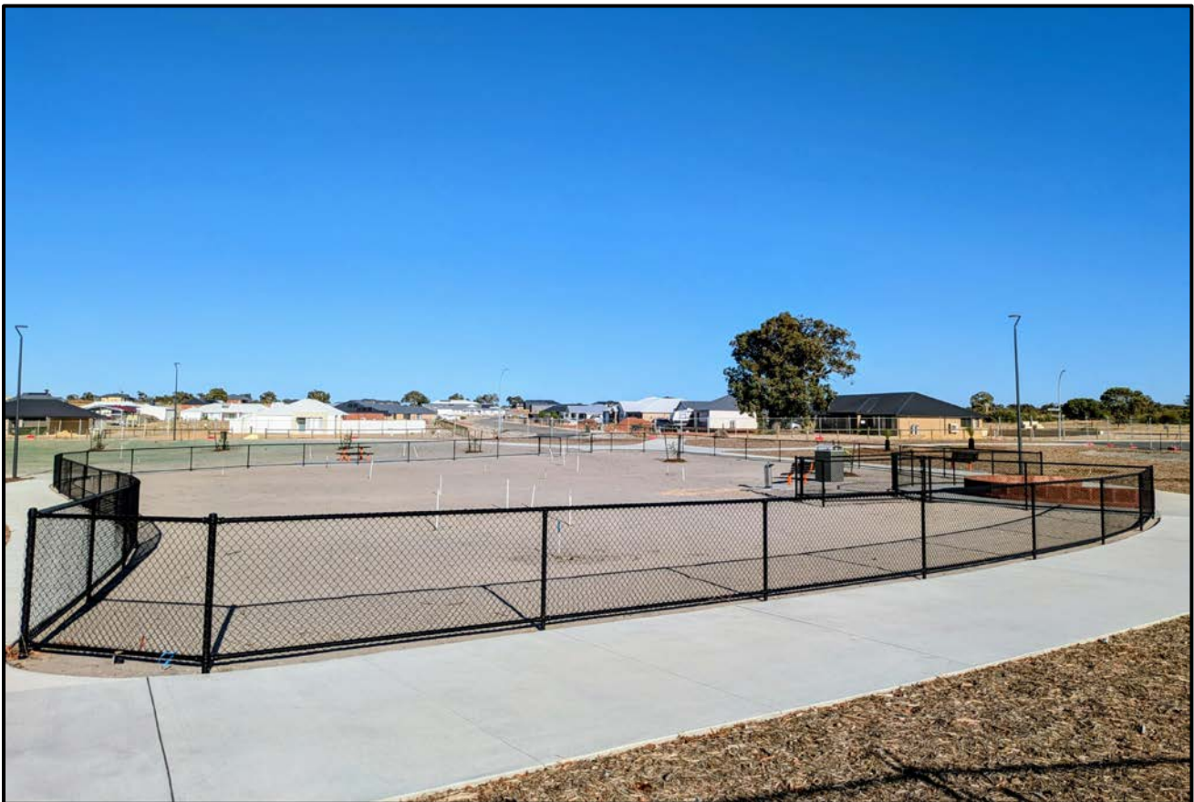
Photo 1: Wildflower Ridge dog exercise area under construction - March 2026 (EMDS)