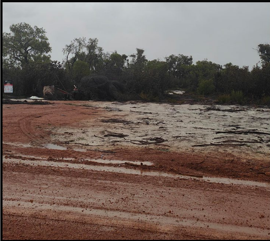
Figure 3: Northern Boundary of Lot 101

Images of one site visit from May 31 st 2023 can be seen below. These images illustrate that clearing has already occurred along the verge (on Shire land) and within the border of Lot 101. The Shire's Technical Services Department gave approval for the applicant to clear vegetation within the verge, however extensive clearing has occurred within the applicant's lot which is larger than the minimum firebreak requirements as per the Shire's Firebreak and Bushfire Hazard Reduction Notice 2023/24. This will be further explained in the Officer Comment section.