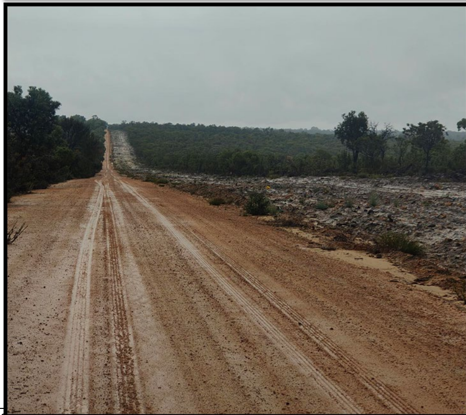
Figure 4: Eastern Boundary of Lot 101