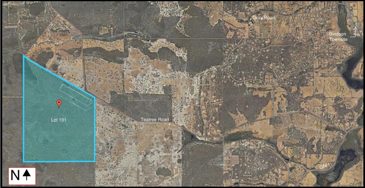
Figure 1: Location Plan