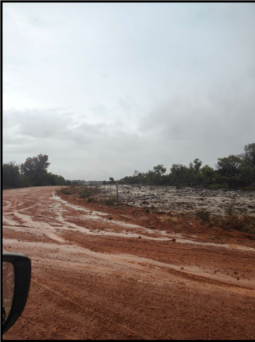
Figure 5: North-Eastern Boundary of Lot 101.