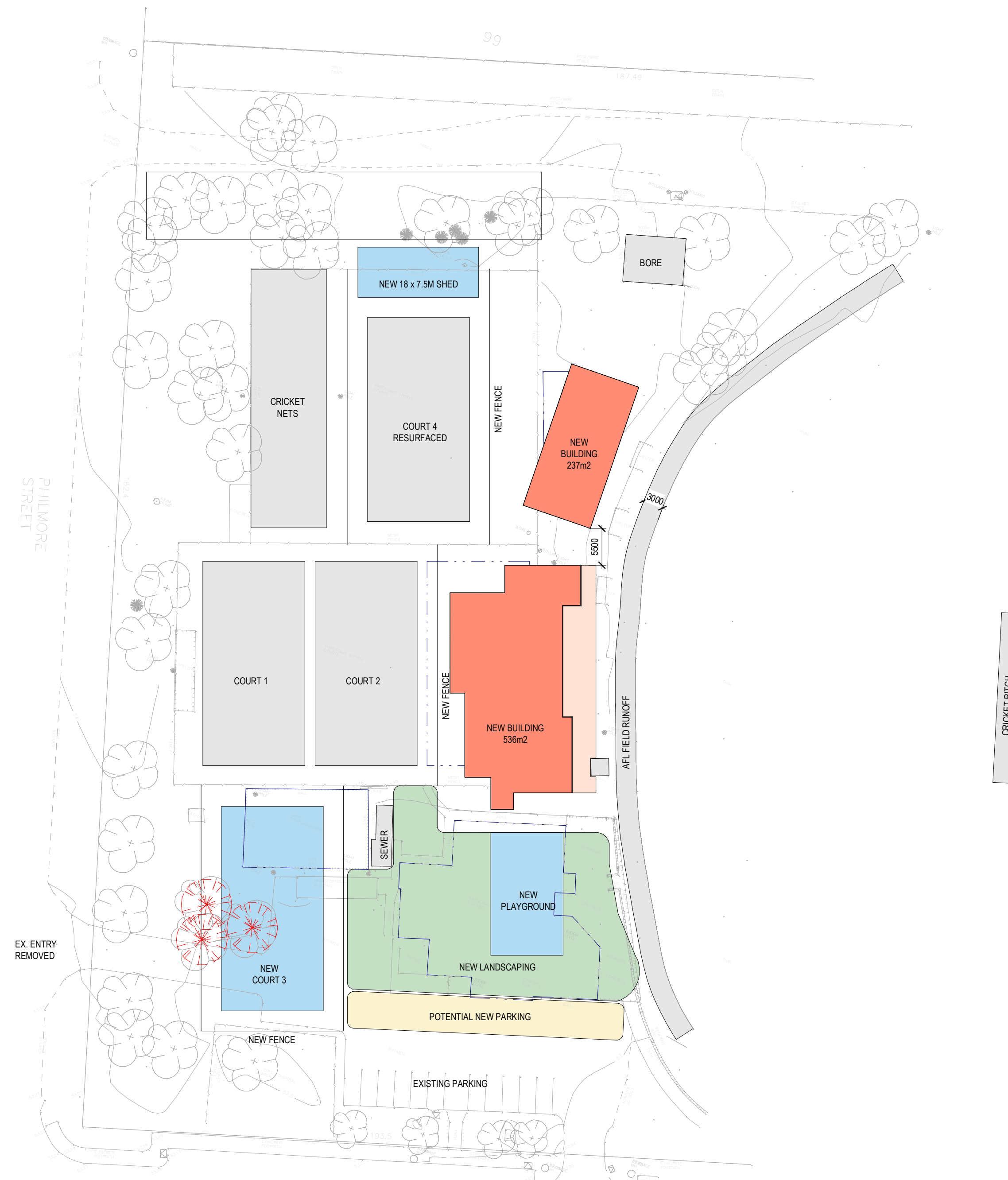
SITE LAYOUT 1 : 500